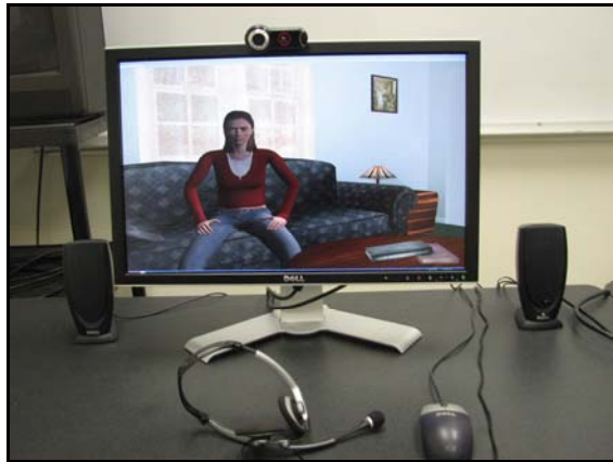
Figure 1: Justina Virtual Patient

based on the virtual human technology developed at USC (Kenny et al., 2007; Swartout et al., 2006).